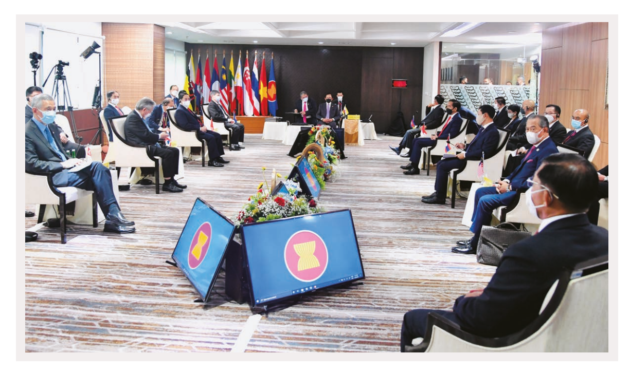
▲ The leaders of the Association of Southeast Asian Nations (ASEAN) countries met in Jakarta, Indonesia on April 24, 2021.

As the world concentrates on climate change, China has committed to reaching peak carbon dioxide emissions before 2030 and achieving carbon neutrality before 2060. Accomplishing such goals is difficult for any country but especially for China because its energy input for each unit of GDP is 1.5 times that of the global average.